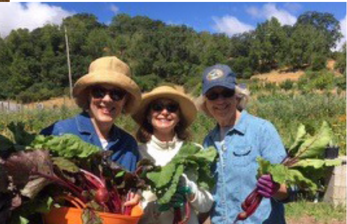
UC Marin Master Gardeners teach how to grow and harvest vegetables at Indian Valley Organic Farm and Garden, 2018